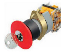
Key-Lock Mushroom-Head Switch Form-F14 & F24

F21, F22, F23 & F24 With Metallic Bezel Ring