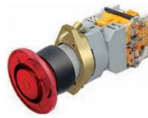
LED-Lighted Mushroom-Head Switch Form-F13 & F23