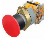
Non-Lighted Mushroom-Head Switch Form-F12 & F22